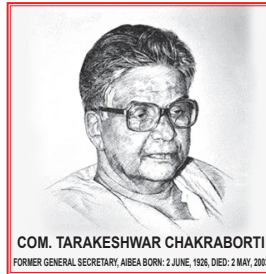
COM. TARAKESHWAR CHAKRABORTI FORMER GENERAL SECRETARY, AIBEA BORN: 2 JUNE, 1926, DIED: 2 MAY, 2003

Many hyped up schemes such as Digital India, Make in India, Start Up India, Stand Up India and Swachh Bharat have been more of talk and less of action. In several key areas, we have a bunch of yojanas (schemes), statutes and ordinances that need to deliver results very quickly. The two